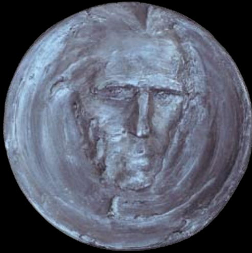
MEDALJA : MEDAL : ACRYSTAL : 30 cm