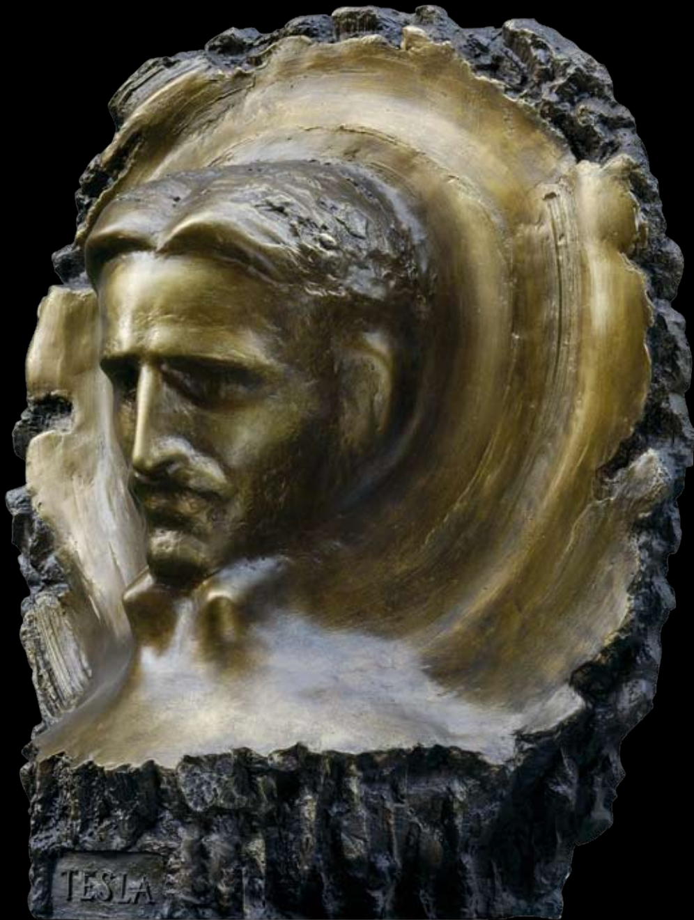
TESLA VI : ACRYSTAL : 80 cm