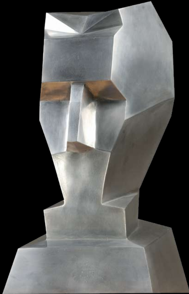
TESLA V : ALUMINIJ : ALUMINIUM : 68 cm