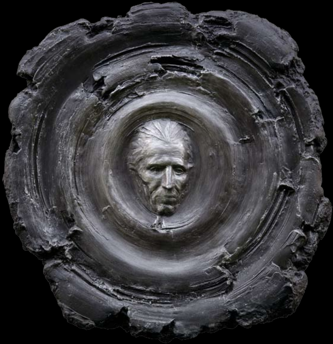
TESLA VII: ACRYSTAL : 107 cm