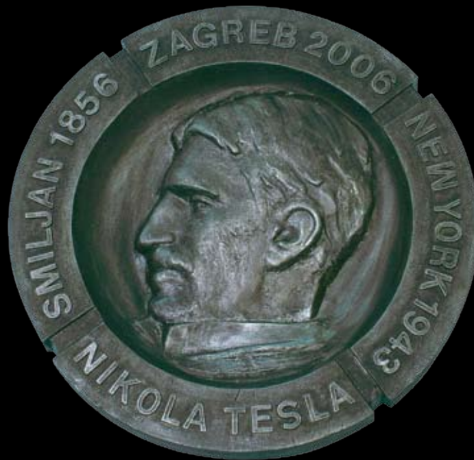
MEDALJA : MEDAL : GIPS : PLASTER : 30 cm