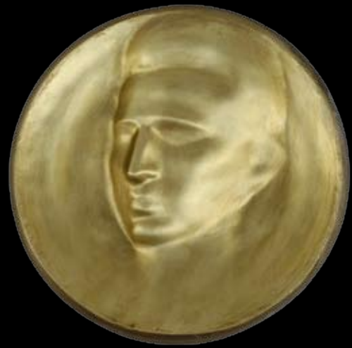
MEDALJA : MEDAL : ACRYSTAL : 29 cm