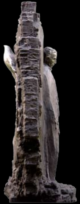
TESLA X : ACRYSTAL : 83 cm