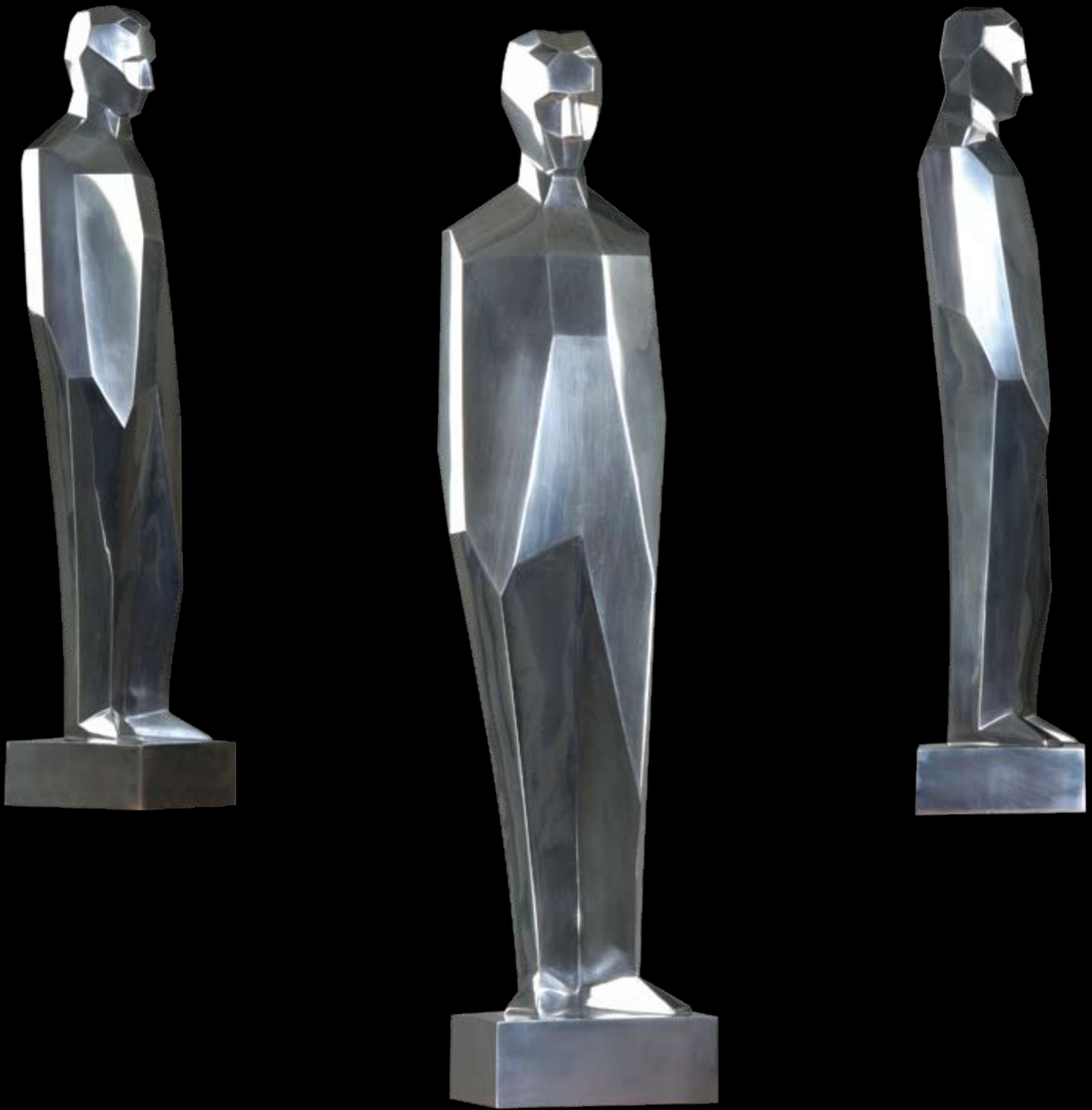
TESLA IX : ALUMINIJ : ALUMINIUM : 78 cm