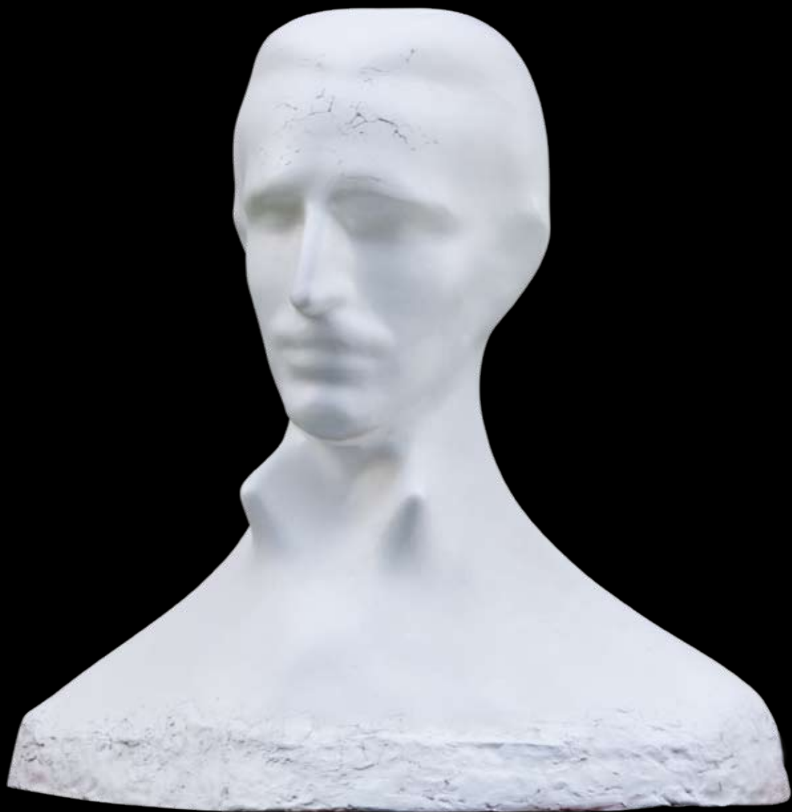
TESLA II : TERAKOTA : TERRACOTTA : 60 cm