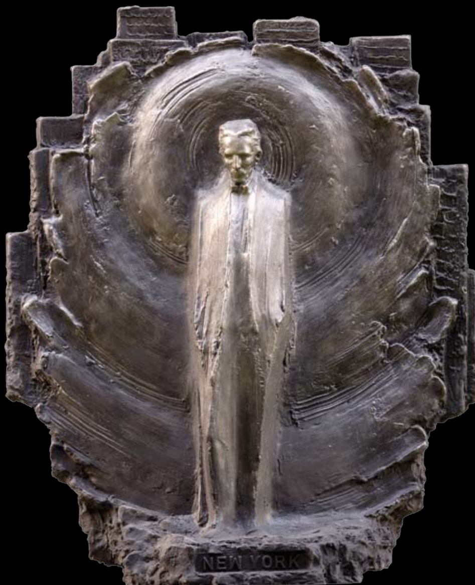
TESLA X : ACRYSTAL : 83 cm