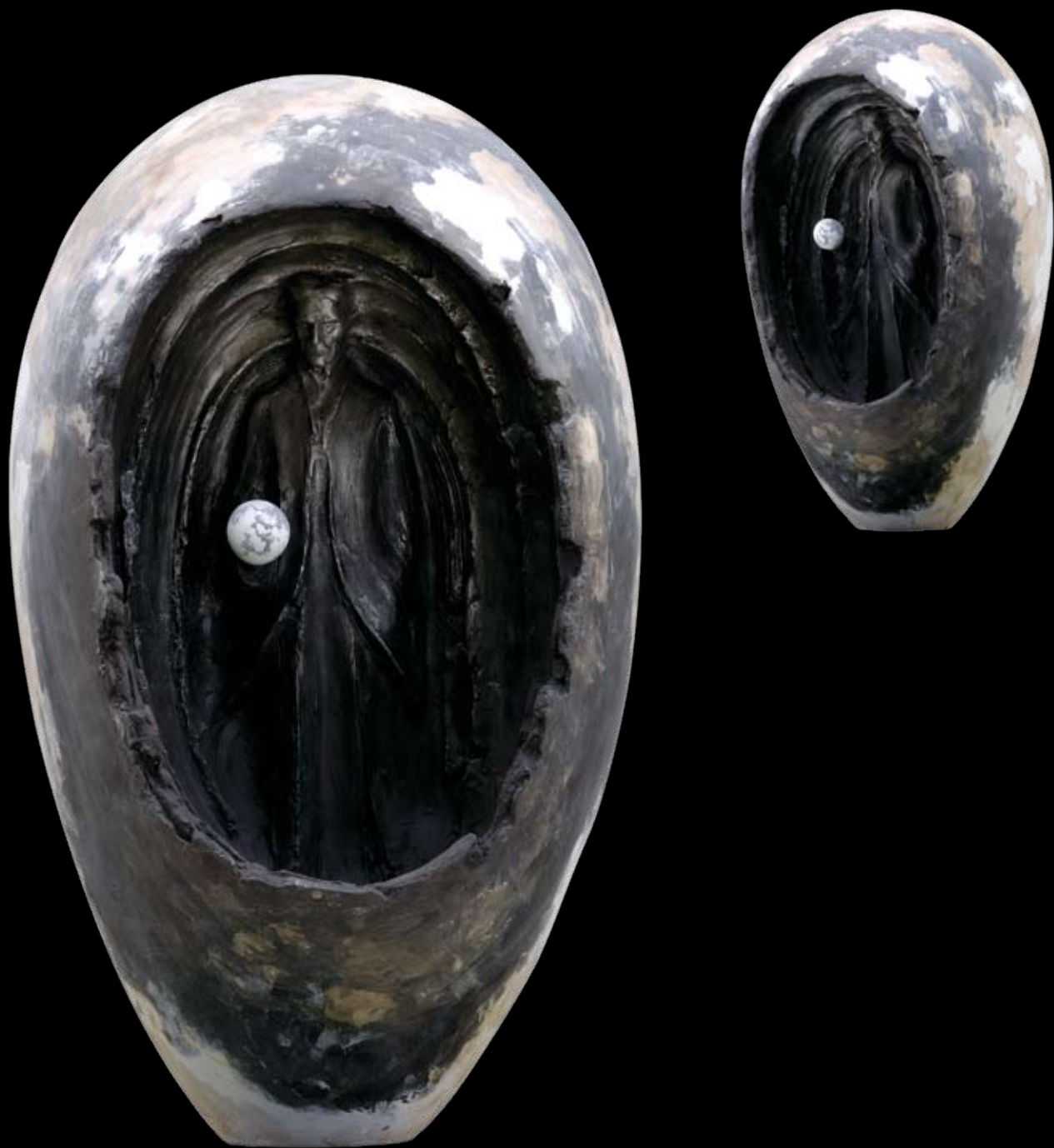
TESLINE VIZIJE : TESLA VISIONS : SMOLA : RESIN : 120 cm