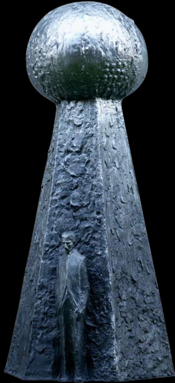
TESLIN TORANJ : TESLA TOWER : SMOLA : RESIN :125 cm