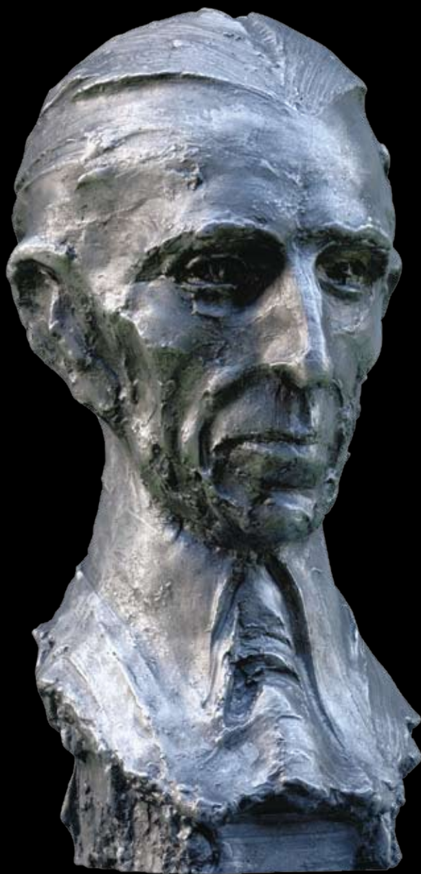
TESLA IV : ALUMINIJ : ALUMINIUM : 55 cm